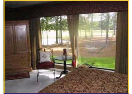
Master Bedroom View