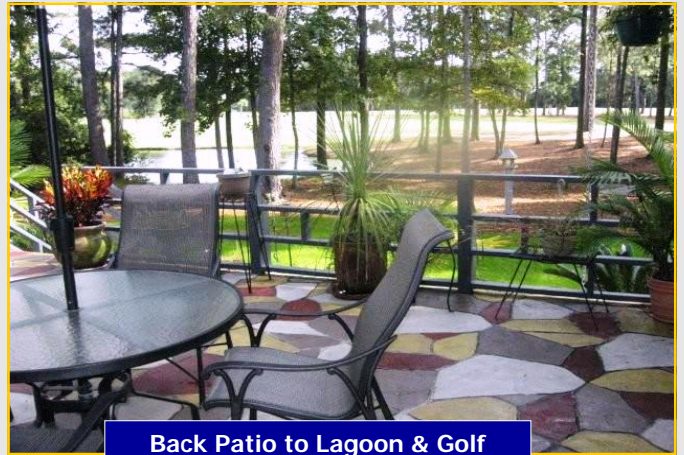
Back Patio to Lagoon & Golf

Purchase price includes Membership Initiation Fee.