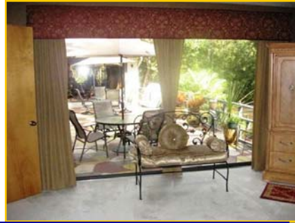
Master to Back Patio