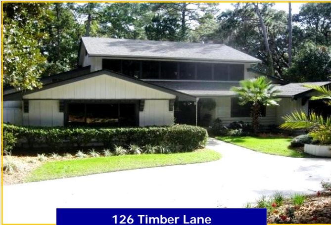
126 Timber Lane

Legal Address (Lot#): 6 MOSS CREEK Approx. Sq Ft: 3,000 Year Built: 1987 Lot Size: 197x115x188x115 View: Lagoon to Golf (1st & 9th holes of South Course) Furnished: No (Can be purchased separately) MLS# 263386