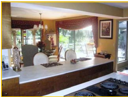
Kitchen & Breakfast Bar